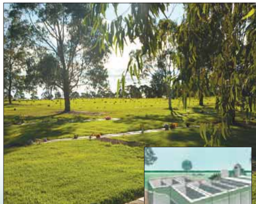
OPEL used in a lawn cemetery