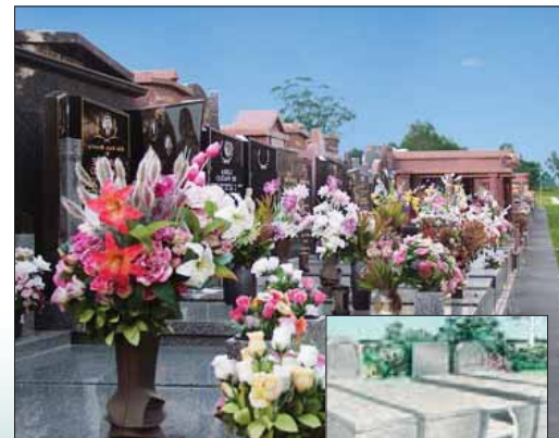
Fawcner Underground Vault Section